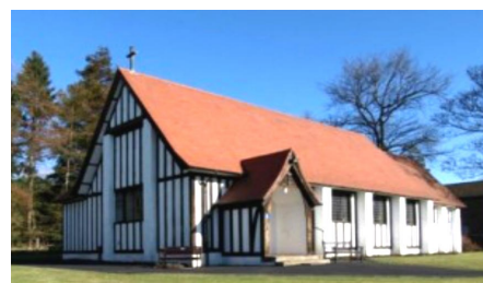
Holy Trinity Monifieth