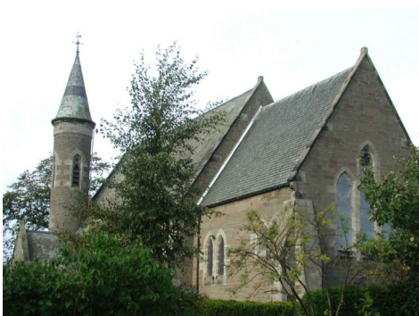
Holy Rood Carnoustie

The post advertised is for a 'Priest in Charge' and 'Transitional Minister' - the role involves settling the shared ministry between the charges, building up the strong lay