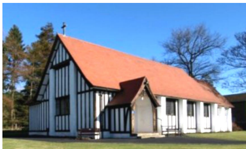
Holy Trinity Monifieth

This coming Friday there will be an advertisement in the 'Church Times' for a priest to serve the SEC churches in Carnoustie and Monifieth, Holy Rood and Holy Trinity.