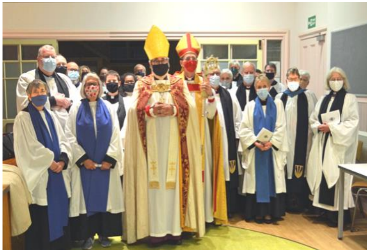
Clergy, lay readers and choir after the service

An enhanced cathedral choir and a good turnout of diocesan clergy and lay readers all added to the celebration and remembrance—after last year’s service had to be held on Zoom due to Covid restrictions. A reception with refreshments followed with a chance for those attending to catch up with others from around the Diocese. We are still in the pandemic, but the easing of restrictions allows a careful return of some elements of ‘normal’ church and Diocesan life.