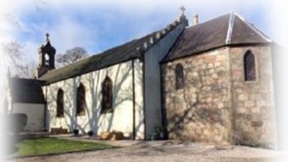
St Ternan's Muchalls

Please contact the charges directly or the diocese ( office@brechin.anglican.org ) if you wish to attend—there will be limited Covid-safe catering on offer after the Stonehaven licensing. Clergy/lay readers are welcome to robe. Choir dress if you have it available.