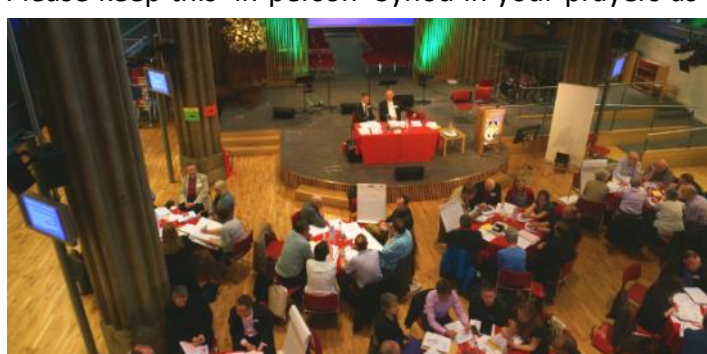
The SEC General Synod meets in P's & G's Church in Edinburgh

Please keep this 'in-person' Synod in your prayers as