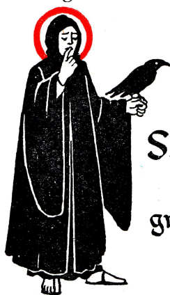
S. BENEDICT founded one of the great Religious Orders

Tuesday, 6 July – St Palladius , Bishop, sent to Ireland in 431 to combat the Pelagian heresy, but expelled after a short time. Worked in Scotland, and associated with Stirling and Fordoun in the Mearns.