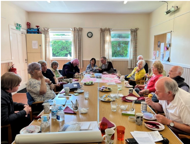
Busy discussions at Holy Trinity

On Saturday 3 June members of Holy Trinity Monifieth took part in two diocesan Resource Workshops, looking at ways to refresh and open up their building and grounds for visitors, and planning activities that would help to nurture the church community and make connections with the wider local community. There was a great turnout, lots of good ideas and excellent cake!