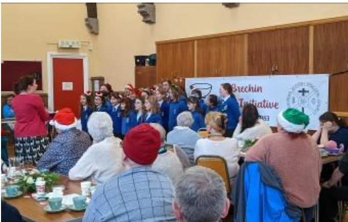
Maisondieu School pupils sing

St. Andrew's, Brechin has been awarded nearly £10,000 from the Community Lottery Grant scheme, for its work distributing a simple cup of (frozen) soup and some bread, to local people who are on their own, struggling with the cost of living or who simply like to see a friendly face and a brief chat on the doorstep.