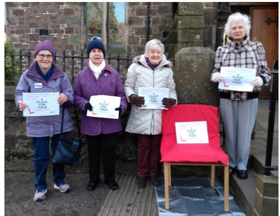
The Red Chair: Photo courtesy of C. Berry.

This special time was marked at St Mary's Broughty Ferry in a number of ways. On Nov 25th, encouraged by Mothers Union, a short vigil was held outside church and passers by were encouraged to chat and given information leaflets about domestic violence. An empty red chair was placed there as a visual symbol of those absent because of gender based abuse. The empty red chair then remained in church for 16 days.