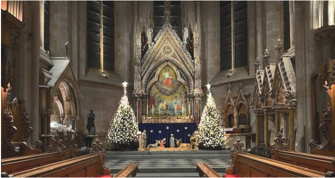
The Cathedral ready for Christmas

The church communities of the Diocese are celebrating Christmas with a wide variety of Christmas carol services and eucharists. The office has created a list of the services: this can be found on the website at https://www.thedioceseofbrechin.org/news/entry/christmas-carols-and-services-in-the-diocese