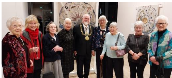
The stitchers meet the Lord Provost

The “Cathedral stitchers” have completed the work on the Dundee Unesco panel, and the whole tapestry - 35 panels - will be on show in the V&A Dundee from now till 28th April, with free entry. The group are now discussing further work, and meet regularly on Fridays at 10.00 in St Roque's hall.