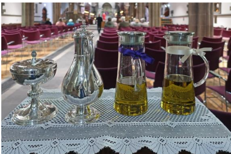
Chrism Eucharist: oils to be blessed

The annual Diocesan Chrism Eucharist takes place in the cathedral on Maundy Thursday at 11am. The service will have the blessing of oils (chrism and healing) for the coming year and a thanksgiving and renewal of vows for ordained ministers and affirmation of lay ministries. All clergy, lay readers and those who assist in lay ministries in the church communities of the diocese are warmly invited. Clergy and lay readers—please robe if this is your tradition. Lay ministers: if you robe to lead worship, please feel free to robe as part of this service.