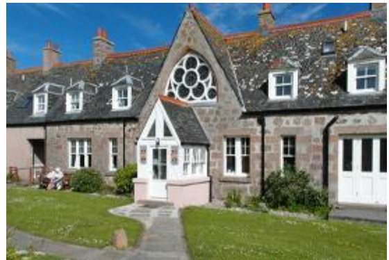
Bishop's House, Iona