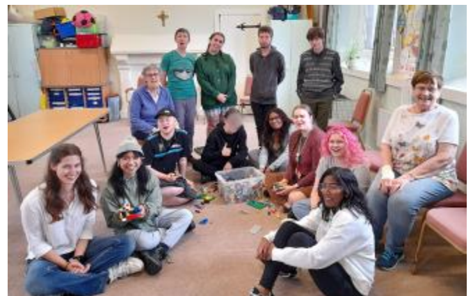
A warm welcome and Lego for pilgrims at Brechin