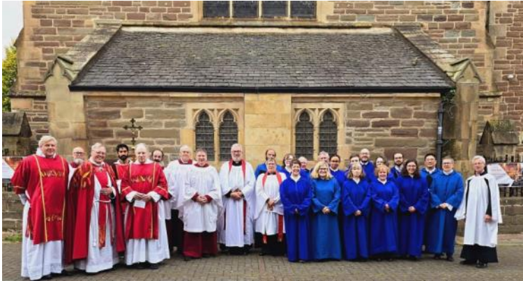
The Strathclyde University Chamber choir with clergy and the altar party