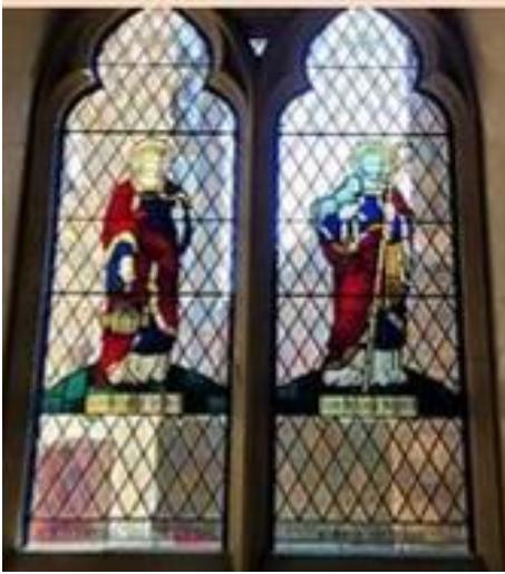
Newly installed windows: photo from St Mary Magdalene's church, Dundee