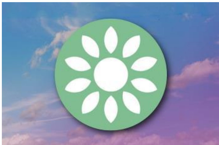
Our Net Zero logo from the Provincial Environment Group

energy bill(s) for 2023. Its importance is that it provides you with your carbon footprint for that year and so you will be able to see how, in future years, measures that you have put in place have reduced your carbon emissions.