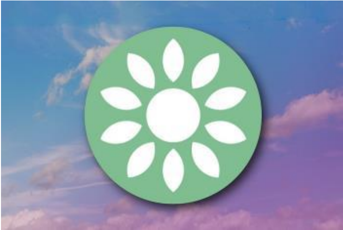
Our Net Zero logo from the Provincial Environment Group

them to input data into the Energy Footprint Tool. Possibly because no deadline for responses was given, relatively few charges in Brechin have responded so far. It is very simple to complete; at the least you simply have to give details from your charge's annual energy bill(s) for 2023. Its importance is that it provides you with your carbon footprint for that year and so you will be able to see how, in future years, measures that you have put in place have reduced your carbon emissions.