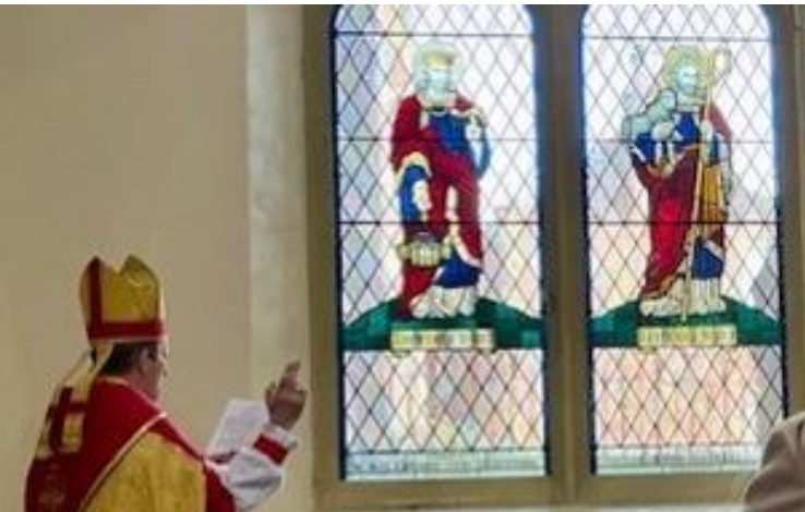
The windows are blessed at the evensong