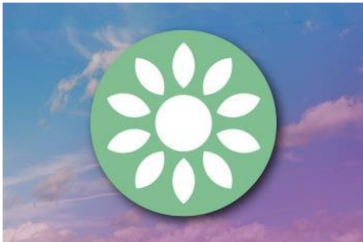
Our Net Zero logo from the Provincial Environment Group

To register for this final webinar of the year, please contact jackn@scotland.anglican.org