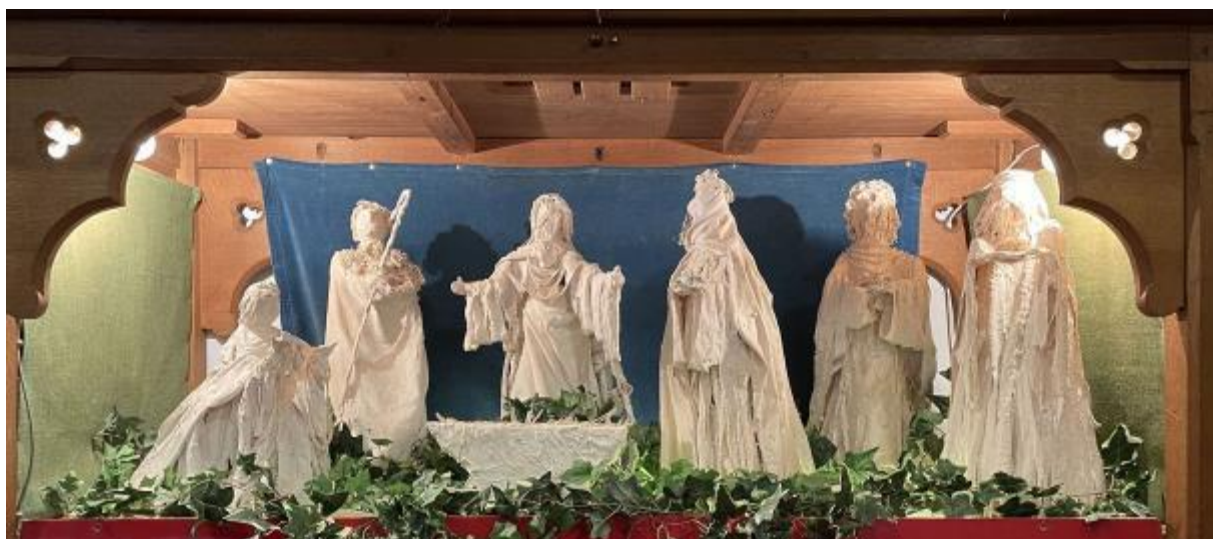
The crib scene at Holy Rood Carnoustie