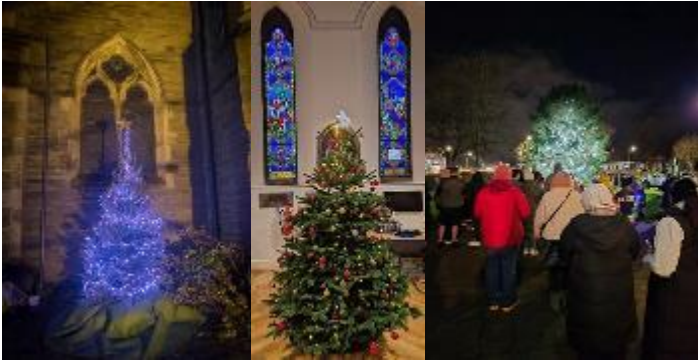
Christmas trees in St. Mary Magdalene's, St. Mary's Broughty Ferry, and St. Ninian's.

The Advent season is now moving fast towards Christmas, and Carol Services, Christingles and other celebrations are starting to be held in our places of worship.