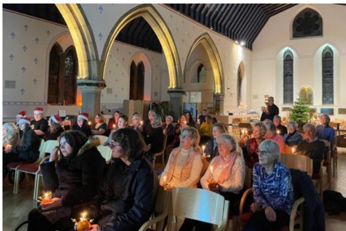
The congregation with their Christingles

The first 'Christingle' service for a decade was held at St Mary's Broughty Ferry on Advent Sunday. The congregation had a wide a range of ages and experiences and the celebration came off without calamity and with much celebration; sweets, fruits and good cheer abounded!