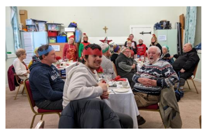
The Christmas Day lunch in full swing at St. Andrew's Church Hall, Brechin.