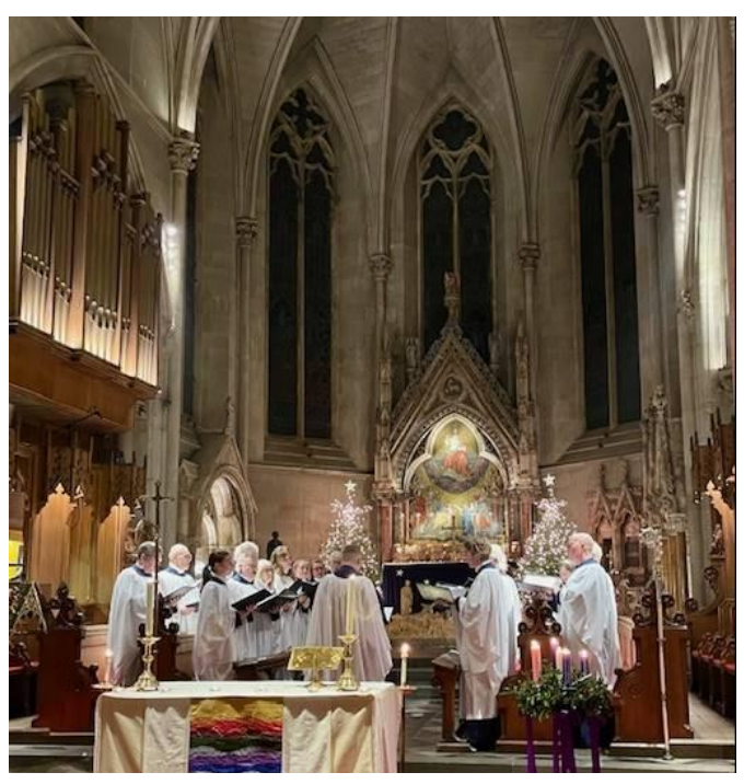
The Midnight Mass from St Paul's Cathedral broadcast as the SEC National service

Christmas 2024 was celebrated in the church communities of the Diocese with services, celebrations and social gatherings. The Scottish Episcopal Church national Christmas Eve online eucharist was broadcast from St Paul's Cathedral in Dundee this year.