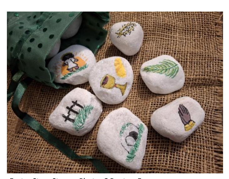
Easter Story Stones.

Even if you have no children who regularly come to your church, Lent and Easter are great opportunities for reaching out to local families. Here are some seasonal ideas to inspire you, from creative prayers to community outreach: contact the Children & Youth Officer for more details.