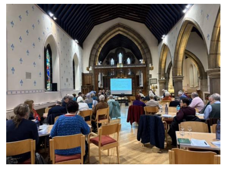
The Synod gathers in St Mary's Broughty Ferry

The Diocese Of Brechin Spring Synod 2025 took place on Saturday 1st March at St Mary's Church Broughty Ferry. Clergy, Lay Representatives and other Synod members gathered for a day of good conversations and engagement with a busy agenda.