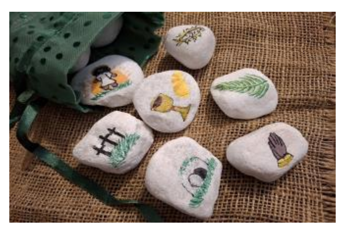
Easter Story Stones.

Join the eco-group of St Paul's Cathedral for a pil-grimage and prayer walk to visit some of some of Dundee's beautiful community gardens. We will meet at the Maxwell Centre, Carnegie Street, DD3 7EW on Saturday 22nd March at 11am. We plan to visit a few locations and finish at the Cathedral. If you would like to join us but don't fancy walking that far then there's also great bus routes with the number 22 bus going between Carnegie Street and the city centre approximately every 15 minutes.