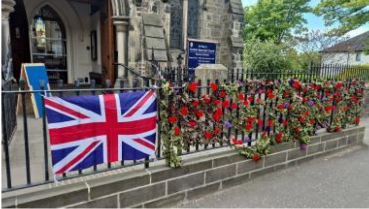
St. Mary's, Broughty Ferry decorated for VE Day.