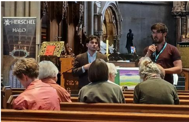
The Net Zero Team welcome delegates and start the day's activities

Saturday 23rd August: the Provincial Net Zero Team, in collaboration with the St Paul's Cathedral Eco-Group, organised a day of networking, fellowship, workshops and inspiration, bringing the Diocese together to inform, celebrate progress and provide guidance for churches on their 'net zero journey'.