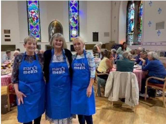
The Afternoon Tea Serving Team Hard at Work

St. Mary's, Broughty Ferry held a fantastic Afternoon Tea last week to help raise funds for Mary's Meals Charity.