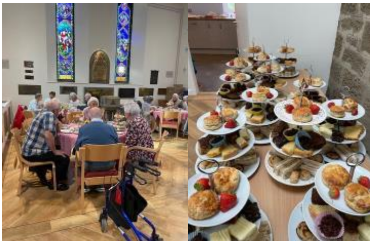
Tea-goers and the Wonderful Spread Offered

This charity, founded in Argyll, Scotland, now provides school meals to more than 2.6 million children in 16 countries around the world. The promise of a good meal attracts these hungry children into the classroom, giving them the energy to learn and hope for a better future. Each school meal costs just 10p, so the price of