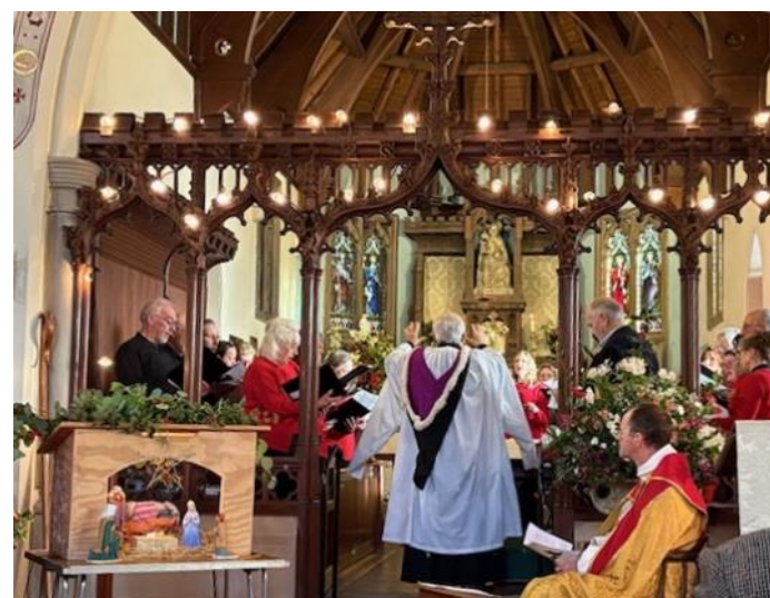
Christmas Carols at All Saints Glencarse with the Perth Gaelic Choir

Celebrations and social events were held throughout the Diocese for Christmas and Epiphany over the past few weeks. The photographs in this Bulletin capture a little bit of the flavour of Christmas 2025.