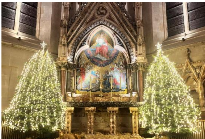
Christmas in St. Paul's Cathedral, Dundee and Holy Trinity Monifieth congregants with their Christingles.