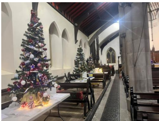
Some of the trees from St. Mary Magdalene's Christmas Tree Festival.