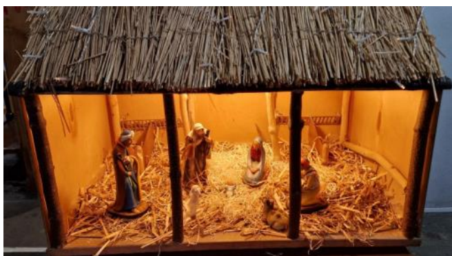
The crib at St Mary and St Peter Montrose