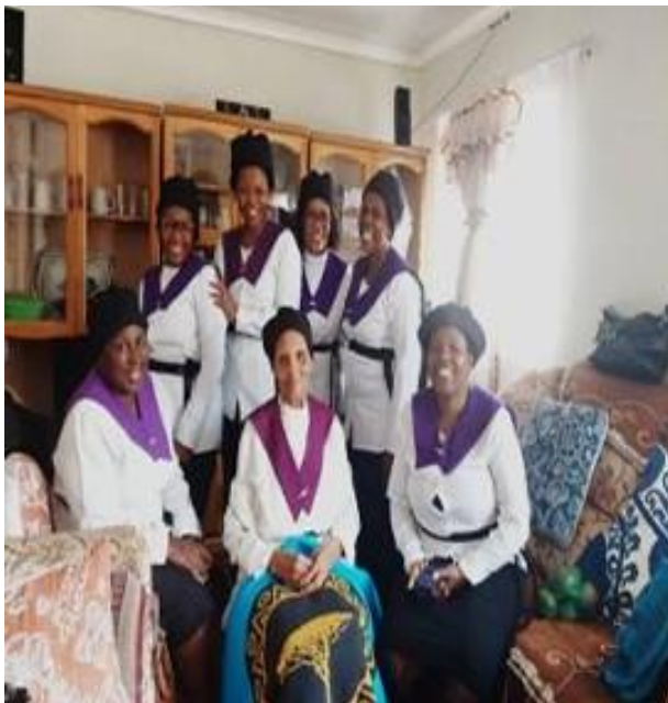
The Home Based Care team.

Care initiative, the Diocese extends its services beyond the NCP centres by reaching vulnerable individuals directly in their homes. This initiative is largely supported by church members, including both retired and active nurses, who generously contribute their time and skills. The programme operates through collaboration with parishes, where volunteers accompany care providers to households in need. Services offered by homebased care teams are basic health support, which includes diabetes support, hypertension care support, and wound care, emotional, spiritual care, trauma healing and counselling, and monitoring of health conditions.