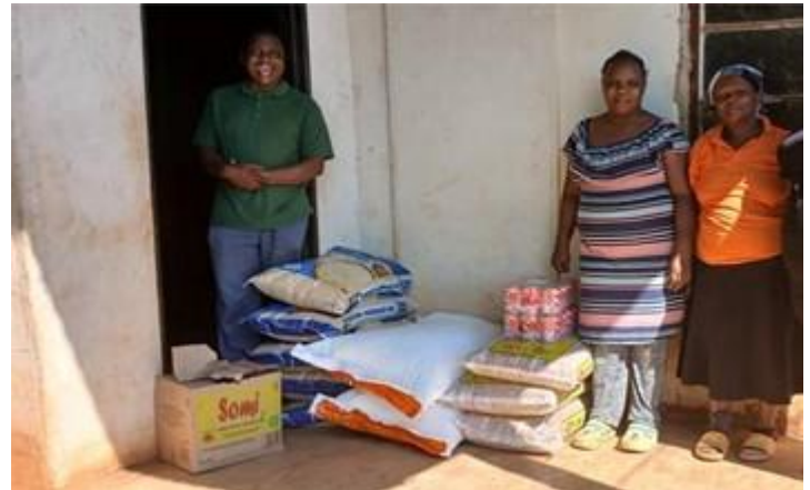
Food delivery to an NCP.