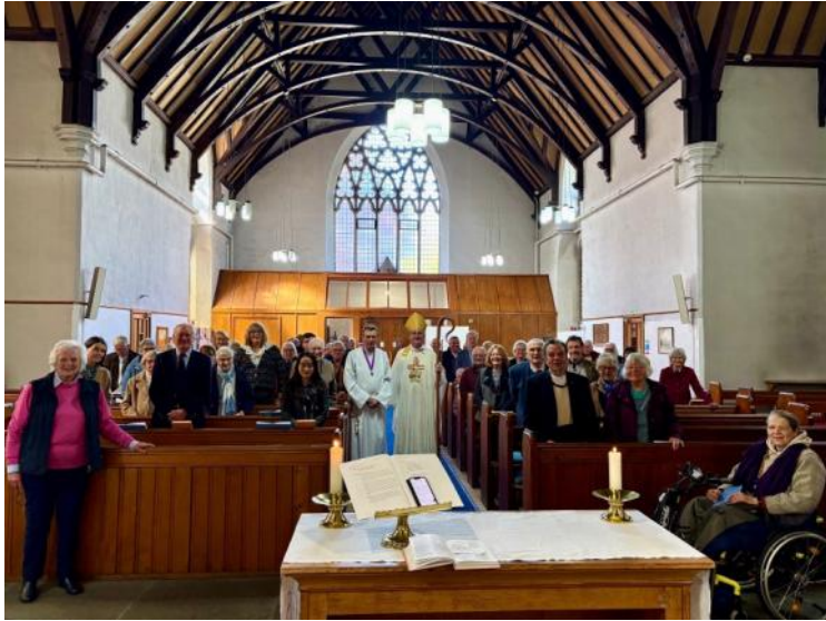
The joint congregations gather for worship in Montrose