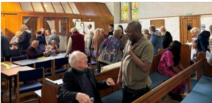
Fellowship shared following the service.

These mid-Angus charges share their Rector and maintain their distinct local identities as Scottish Episcopal congregations in their own contexts.