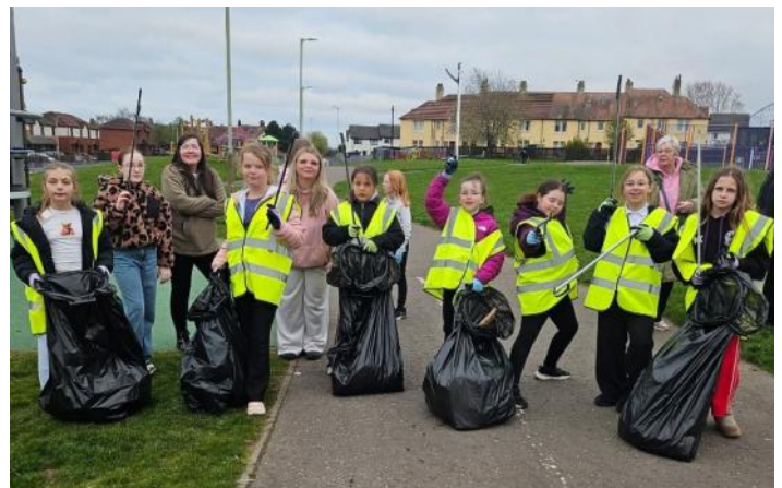
Members and leaders of St. Ninian's Girls Club take part in a litterpick in the church's local area.