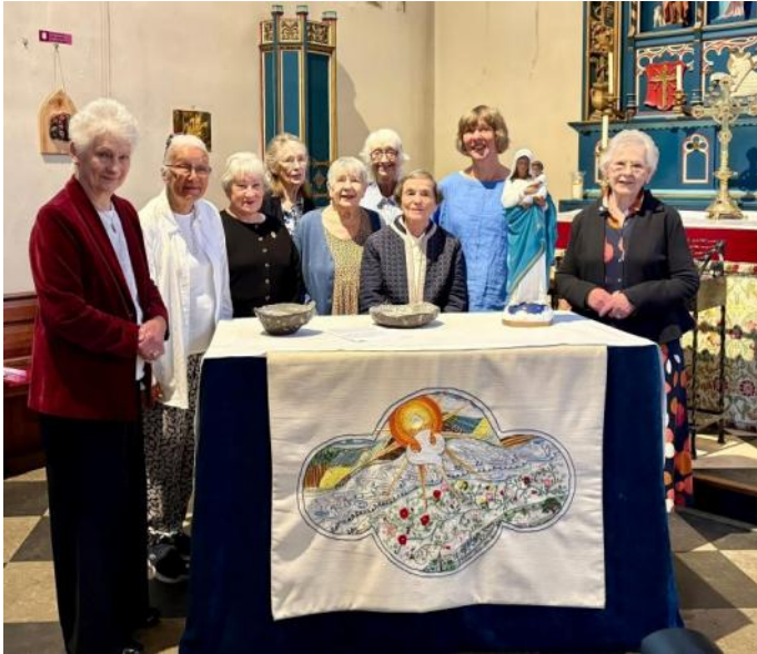
Cathedral Stitchers with the new altar frontal.

Bishop Andrew was with St. Paul's Cathedral Dundee to bless the new Lady Chapel altar frontal made by the talented Cathedral Stitchers.